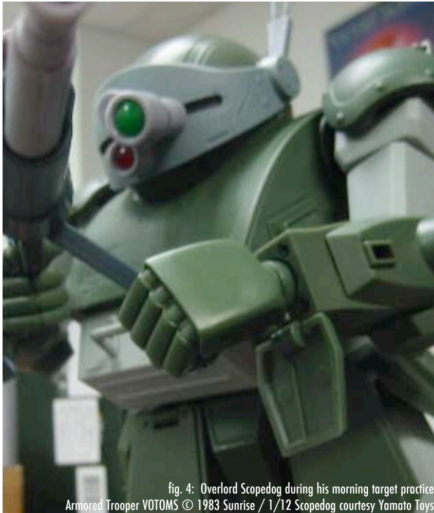
fig. 4: Overlord Scopedog during his morning target practice Armored Trooper VOTOMS © 1983 Sunrise / 1/12 Scopedog courtesy Yamato Toys