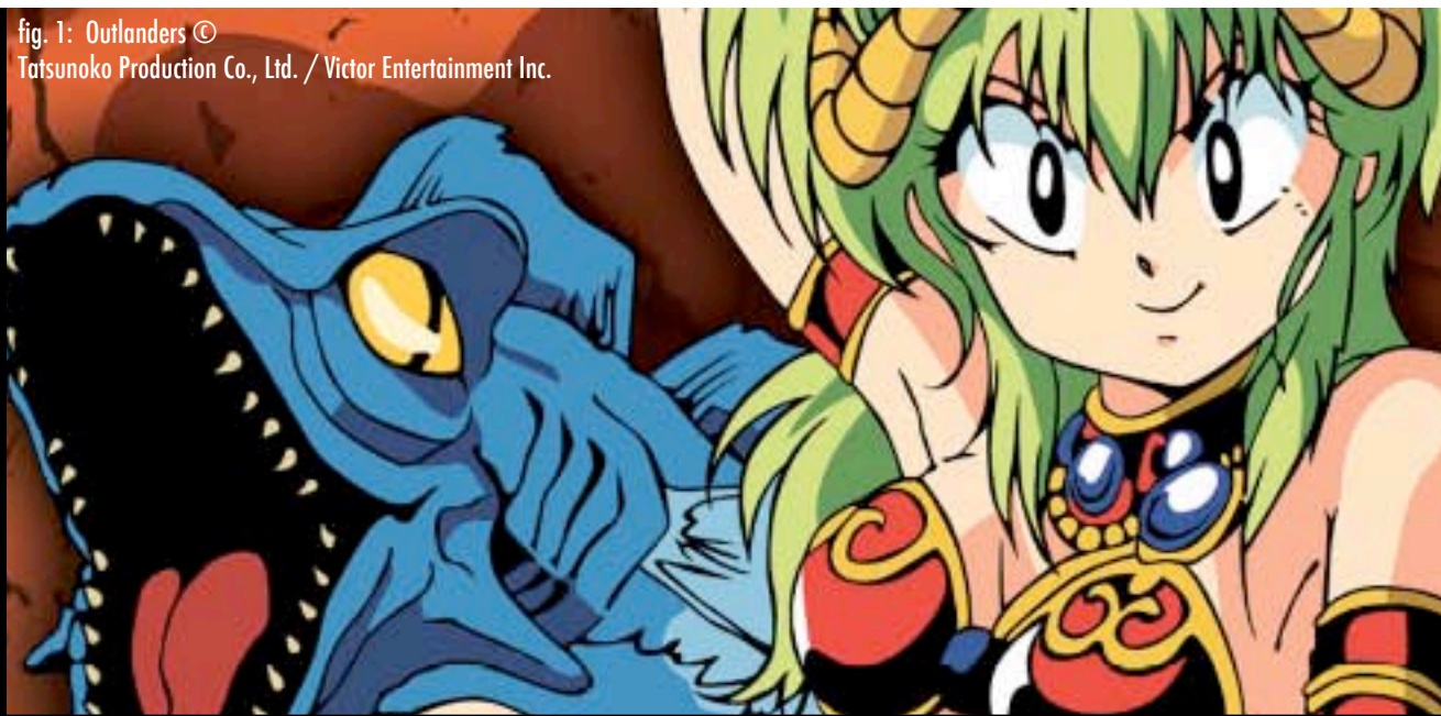
fig. 1: Outlanders © Tatsunoko Production Co., Ltd. / Victor Entertainment Inc.

animeclubs@teamcpm.com centralparkmedia.com/animeu