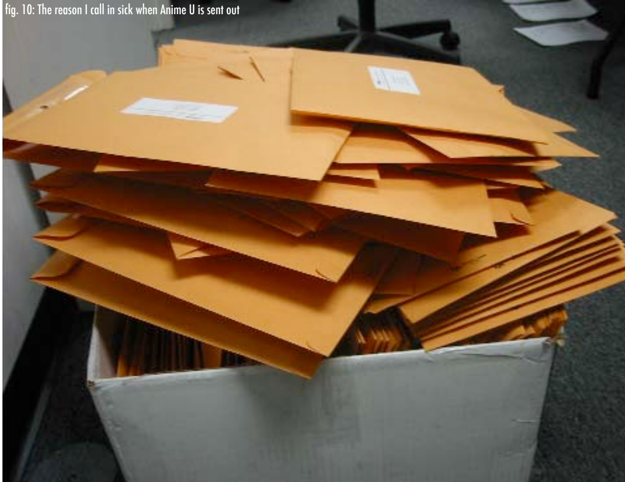
fig. 10: The reason I call in sick when Anime U is sent out

By submitting any materials (including but not limited to reviews, editorials, creative materials, ideas, graphics, photos, comments, concepts, and suggestions for improving or changing existing content) to Central Park Media, you acknowledge and agree to the following: You are at least 18 years of age (or, if under 18, have received permission from a parent/guardian). You automatically grant Central Park Media a royalty-free, nonexclusive, perpetual, and irrevocable right and license to use, reproduce, modify, publish, edit, translate, display, and distribute said materials alone or combined with other works in any form or technology now known or to be later developed throughout the Universe. You waive any moral rights you may have in having the material altered in a manner not agreeable to you.