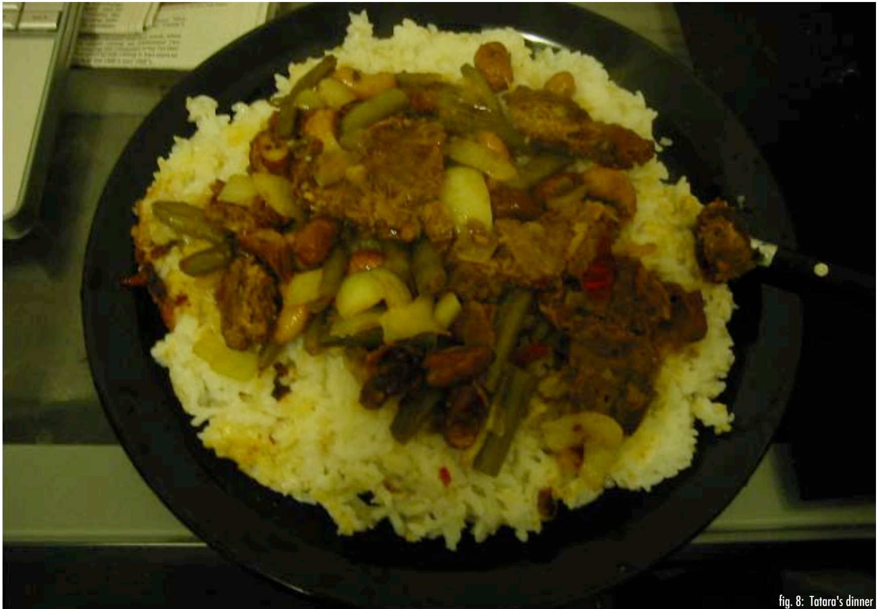
fig. 8: Tatar's dinner