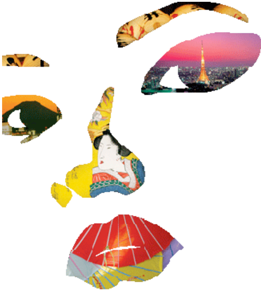
fig. 9: Visit www.TokyoFesta.com for the full listing of the Tokyo Metropolitan Government's free events going on February 7 in New York City