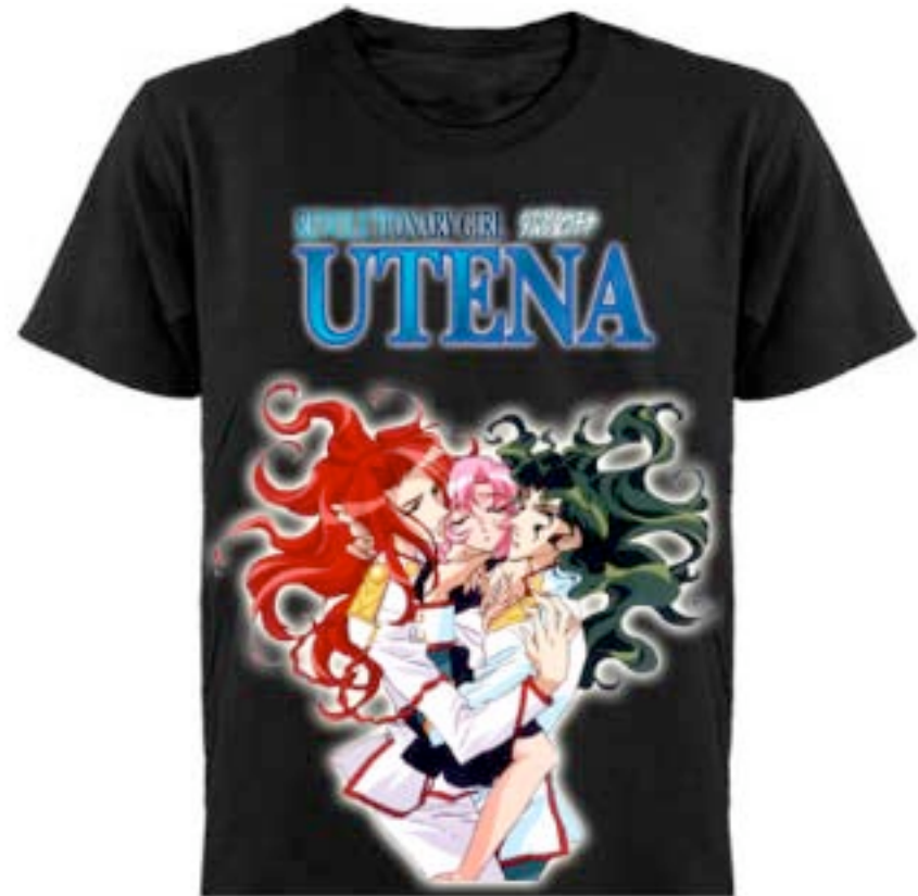
fig. 2: Pre-order Utena and take this limited edition shirt home!

Revolutionary Girl Utena © 1997 Be-Papas / Chiho Saito / Shogakukan / Shokaku / TV Tokyo Gogai! Gogai! • January 2006 • Page 3