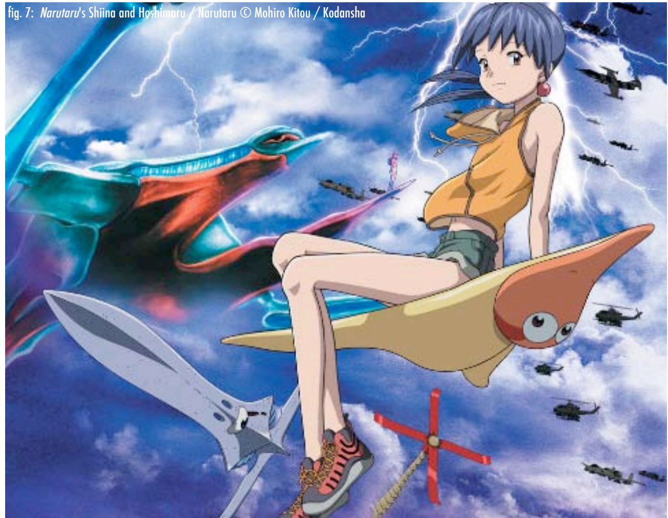
fig. 7: Narutaru's Shiina and Hoshimaru / Narutaru © Mohiro Kitou / Kodansha