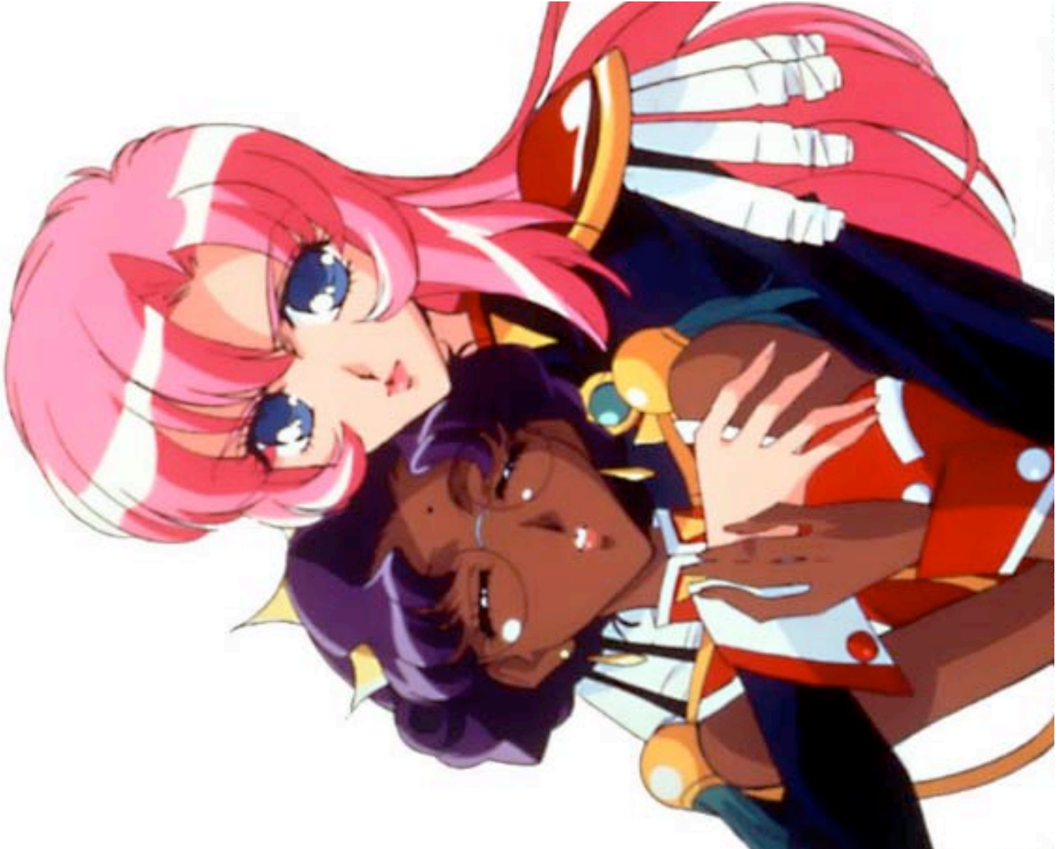
fig. 6: Vote Anthy / Revolutionary Girl Utena © 1997 Be-Papas / Chiho Saito / Shogakukan / Shokaku / TV Tokyo