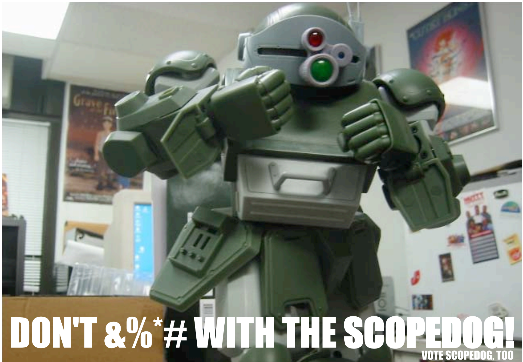
fig. 4: Vote Scopedog / Armored Trooper VOTOMS © 1983 Sunrise / 1/12 Scopedog courtesy Yamato Toys