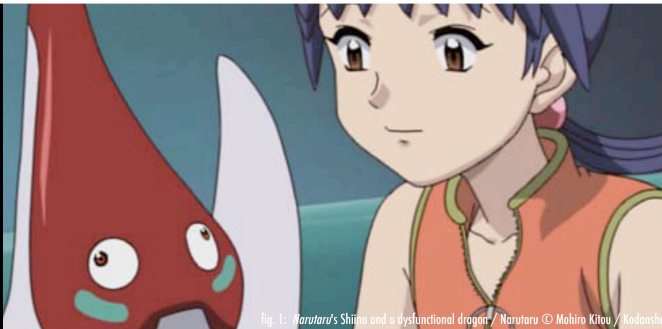
fig. 1: Narutaru's Shiina and a dysfunctional dragon / Narutaru © Mohiro Kitou / Kodansha

animeclubs@teamcpm.com centralparkmedia.com/animeu