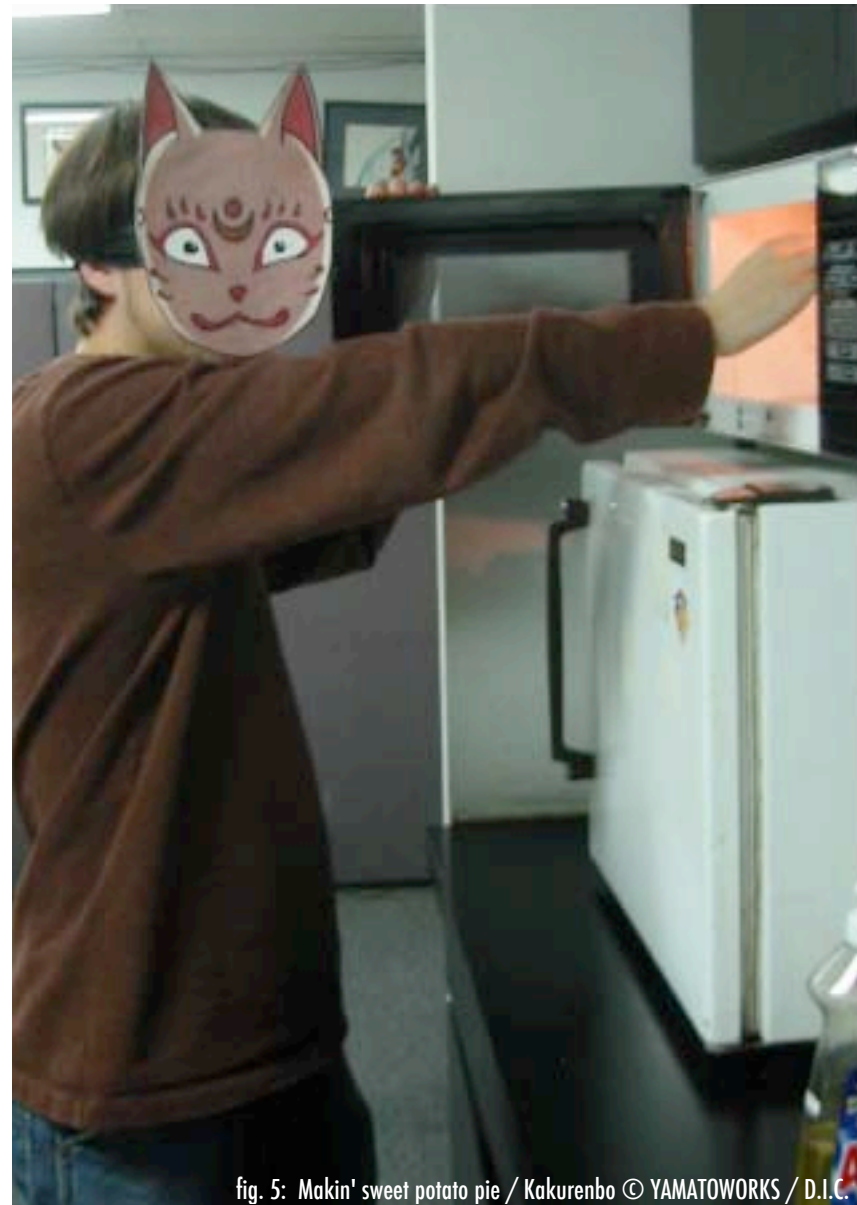
fig. 5: Makin' sweet potato pie / Kakurenbo

Preheat oven to 350 degrees Fahrenheit. Bring the sweet potatoes (chopped and cooked until tender), vanilla, cinnamon, nutmeg, sugar, lemon, and eggs together in a bowl. Blend until thoroughly mixed. Equally distribute the mix into the pie shells. Bake for 45 minutes. That's it. Nice and simple. Too simple to screw up? Not entirely. The first time I made this recipe, I mixed the sweet potatoes too much, creating almost a meringue with the amount of air I had whipped in. The resulting pies were light and fluffy with an intricate sugar lattice structure inside. Beat your own mix to a ridiculous level if you want to try it at home.