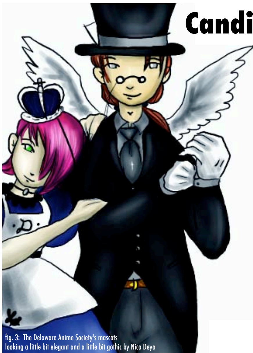
fig. 3: The Delaware Anime Society's mascots looking a little bit elegant and a little bit gothic by Nico Deyo