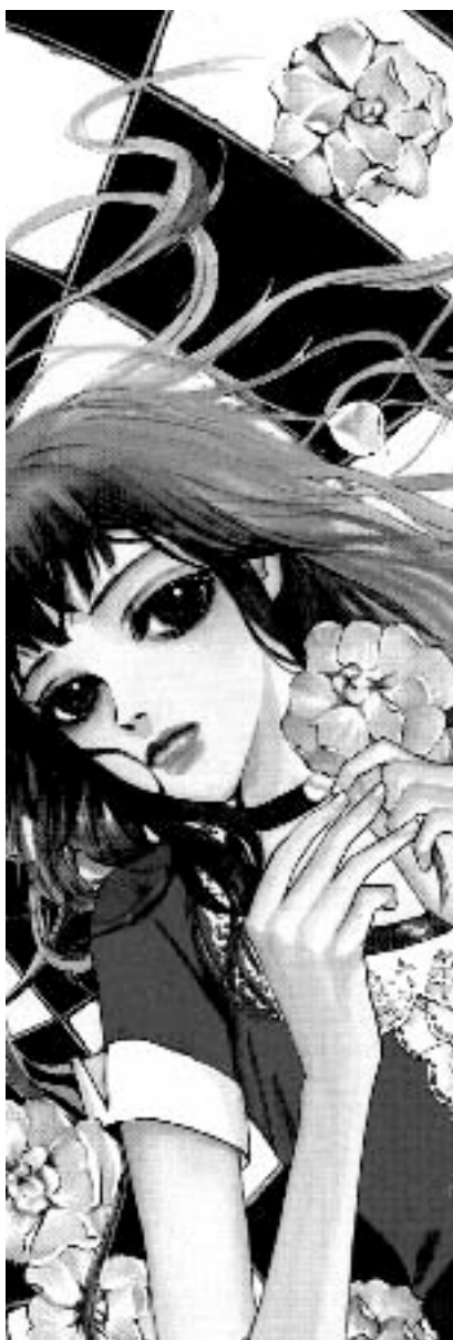
fig. 2: Elegant gothic Yuri / Angel Shop © 2003 Sook Ji Hwang