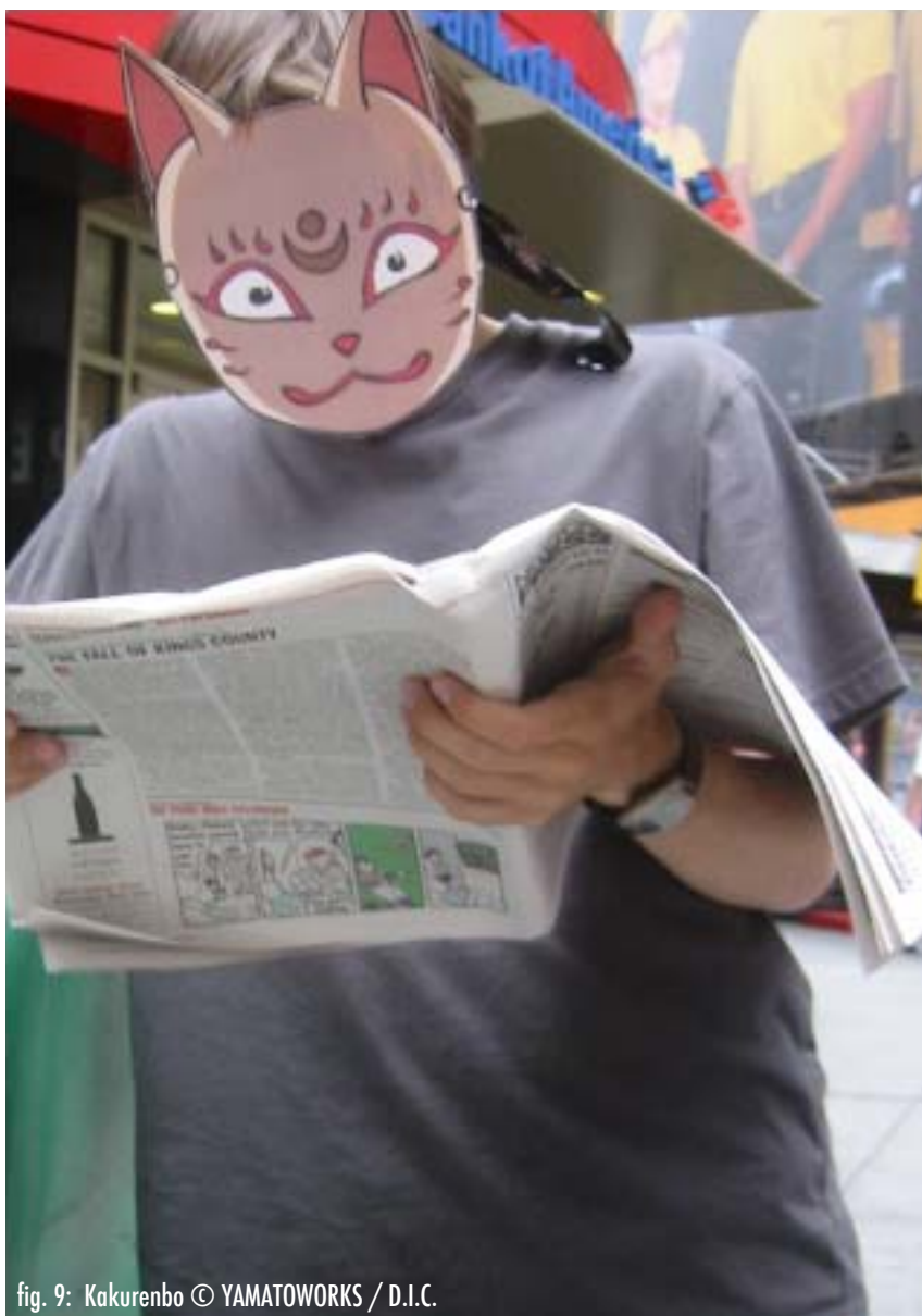
fig. 9: Kakurenbo