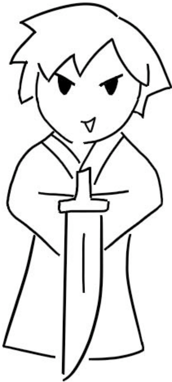
fig. 6: Chibi-Shinigami by Petrina Cheng of the Anime Society of Ithaca College