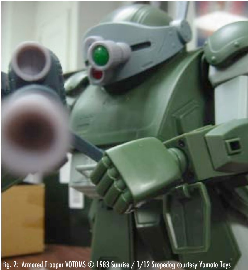
fig. 2: Armored Trooper VOTOMS © 1983 Sunrise / 1/12 Scopedog

Greetings fleshy Earth humans, my name is ATM-09-ST Scopedog, and I'm your new lord and master. You foolishly elected me Gogai! Gogai! 's mascot last month, and as such, you are now all my helpless subjects. My reign, though, won't be all mindless torture and target practice. No, I can be a kind and gentle mechanical overlord. For your knowledge, here's a little more about me.