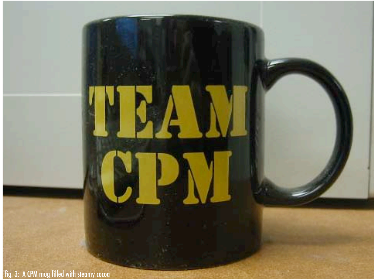
fig. 3: A CPM mug filled with steamy cocoa

Mix all of these ingredients together and sift into a large bowl. After you make the mix, store it in a glass container with a lid. To make, add a 1/3 cup of mix to a mug of hot water; however, you can add more or less to suit your taste.