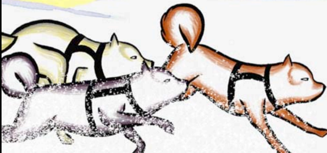
fig. 1: The Boy Who Wanted to Be a Bear © Dansk Tegnefilm 2 Aps / Les Armateurs / Carrère Group / France 3 Cinéma

animeclubs@teamcpm.com centralparkmedia.com/animeu