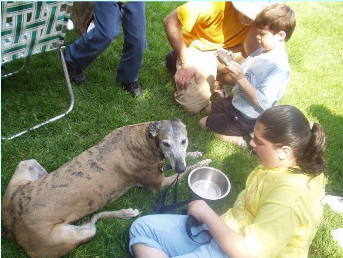
Greyhound Pets of America/Delaware