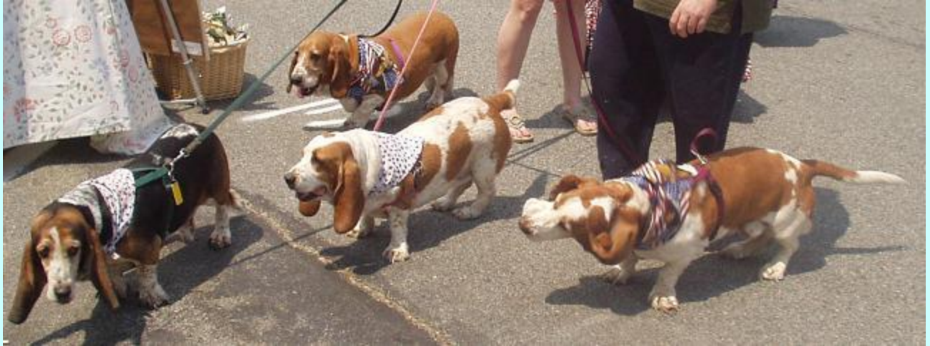
Basset Hound Rescue of Old Dominion