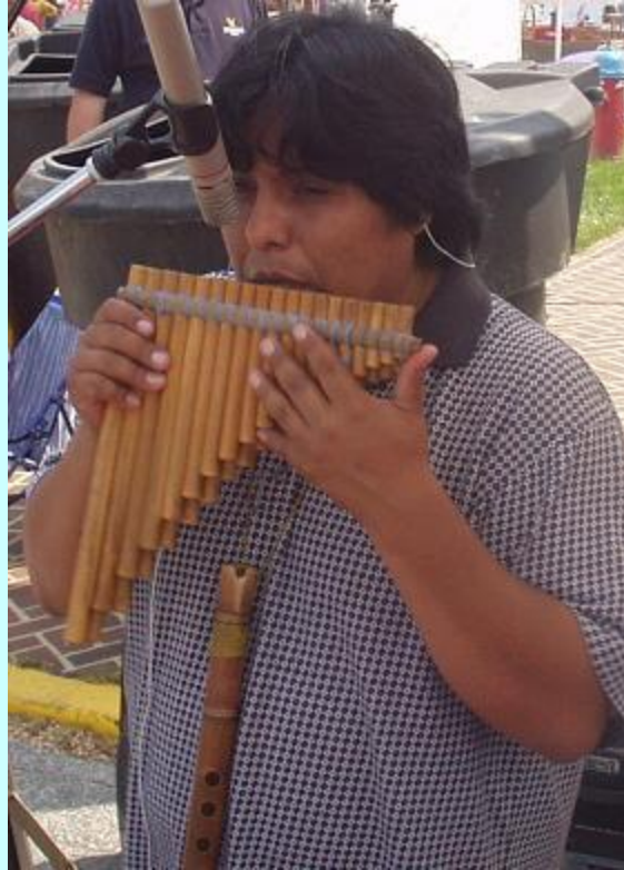
The Pan Flute guy from the group Itumiray.