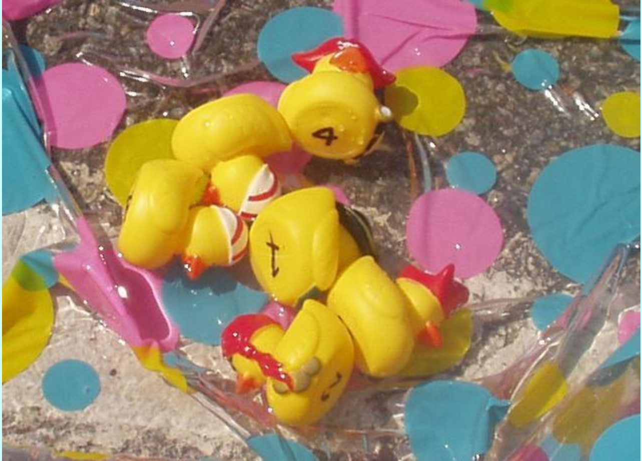
The Infamous Defective Non-Floating Ducks from the Duckpond Game.

For Links to Mentioned Items, see the ARTICLE